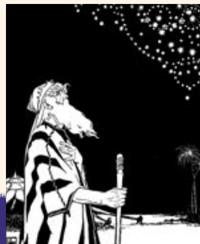
Abraham's Promise: Children like the Stars in the Sky (Genesis 15:5) by Ephraim Moses Lilien