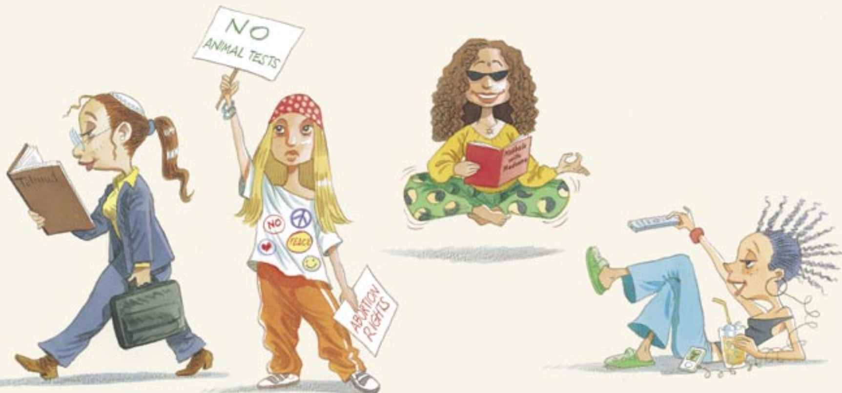
The Four Daughters by Michel Kichka, 2006

Aviva Zornberg , The Particulars of Rapture