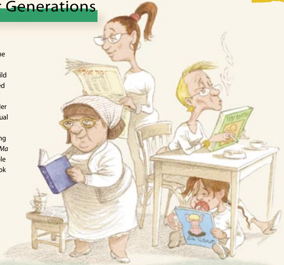
Illustration by Michel Kichka

While the Haggadah urges us to create dialogue and continuity from parent to child, the ideological changes in Jewish life over the last 100 years in Israel have often involved revolting against one's parents' ideals in belief, in dress and even in body image. Each child is identified not by what they ask but what they read. The so-called wise child, the stereotype of the pre-Zionist ultra Orthodox, is a woman not concerned with a slim figure or stylish eyeglasses. Her daily reading is Psalms. The rebellious child is the Zionist intellectual reading the modern novelist Amos Oz. The simple child is of the third generation, which lacks knowledge and ideology. Her reading matter is a newspaper that says in the words of the Haggadah – "Ma Zot - What is this?" Last and still least is the little girl under the table who does not know how to read. She holds her potty training book upside down. Its name – Pot of Pots – is a pun on the Biblical love songs read on Pesach – Song of Songs .