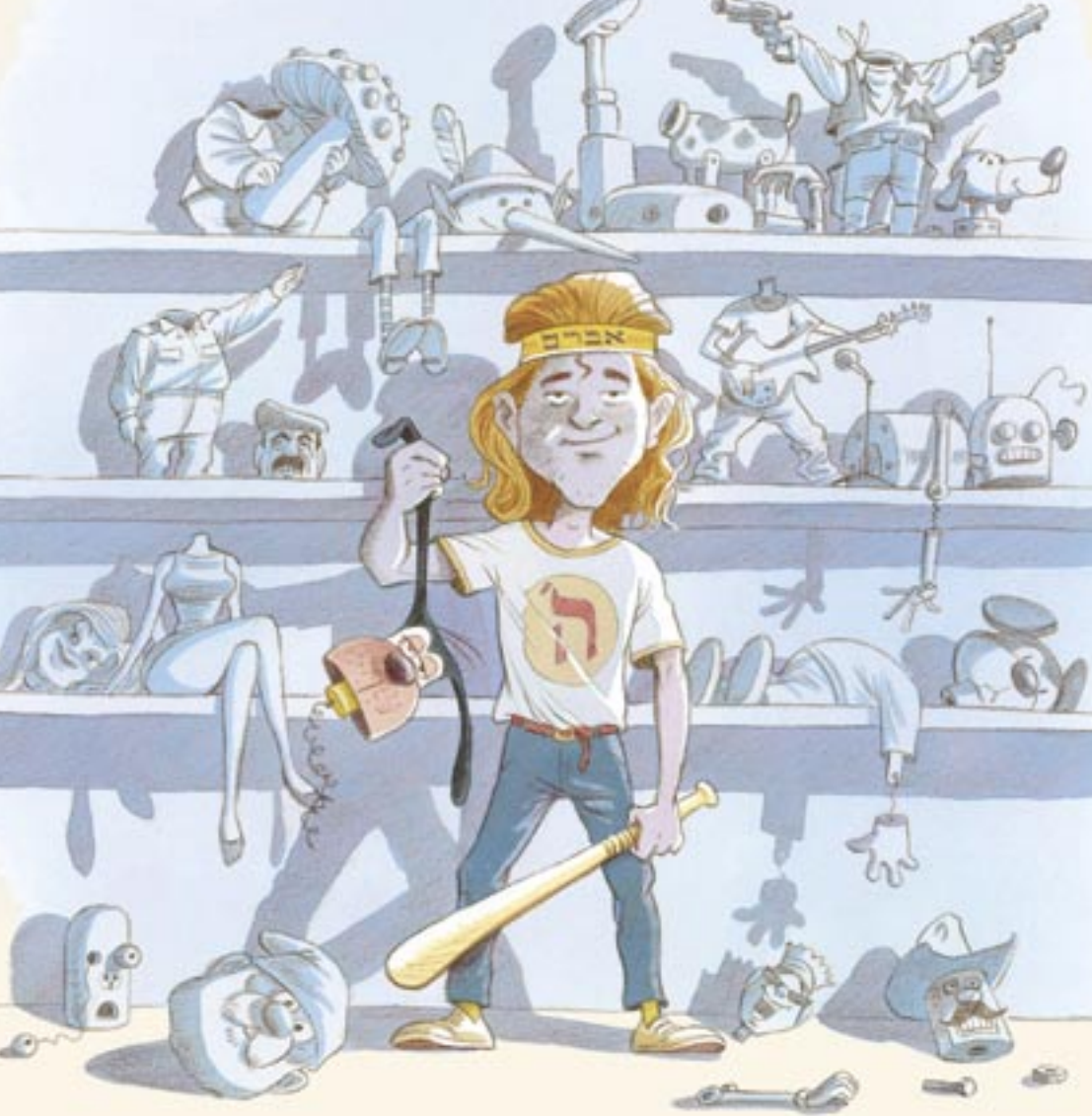
At the Seder the Jews of Djerba, Tunisia, traditionally recount the story of young Abraham rebelling against his father and breaking the idols.