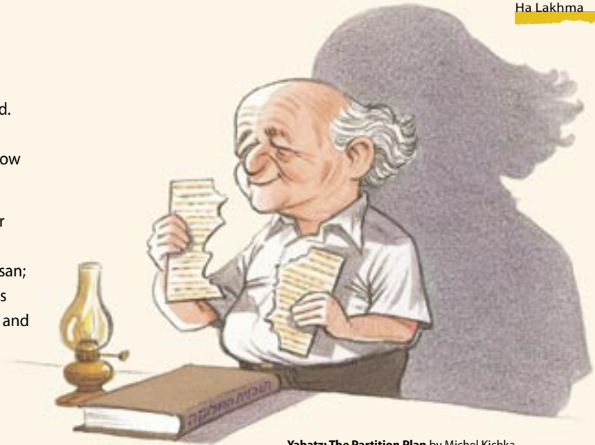
Yahatz: The Partition Plan by Michel Kichka

David Ben-Gurion , first prime minister of the State of Israel, from a speech in 1947 before the U.N. Commission on the Partition of Palestine.