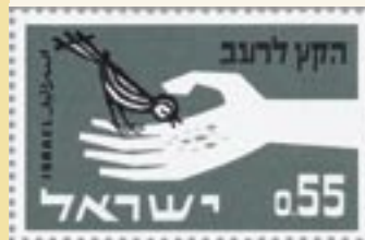
An End to Famine