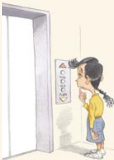
The Four Israeli Sons by Michel Kichka, 2004

Aviva Zornberg , The Particulars of Rapture